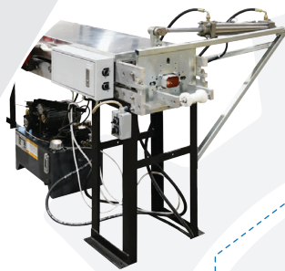
HS Hydraulic Auto-Shear with Power Unit